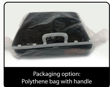
Packaging option: Polythene bag with handle