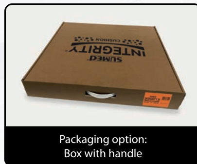
Packaging option: Box with handle